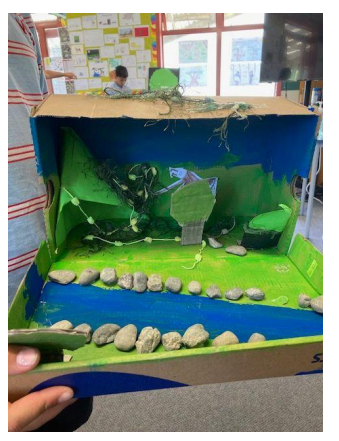
By Walter Fu and Lyo Mclean

In Rata we made dioramas full of native birds and animals. The first step was to make a plan for the diorama. The second step was to bring a box to school. The third step was painting the diorama like the sky, forest and ocean. The fourth step was putting things in your box like your birds or animals or food. The fifth step was to take a photo of you and your diorama. The final step was to take them home. We think everybody's parents were impressed.