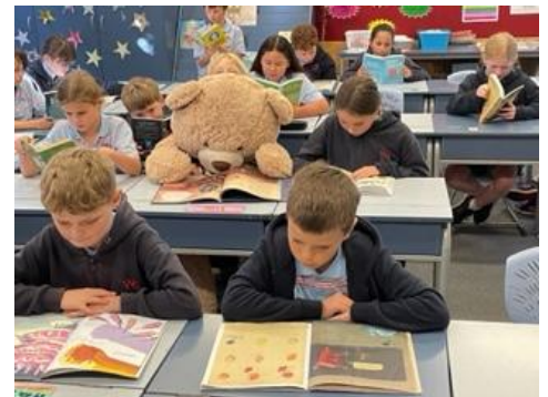
Above: Wazzie Bear Silent Reading with Room 4

Below: Learning how to manage our pocket money during Financial Literacy lessons.