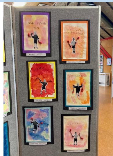
Room 7 Art Gallery Artworks