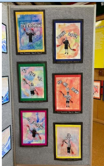
Room 8 Gallery Artworks