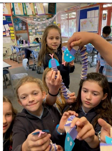
Making paper snakes during an Oral Presentation