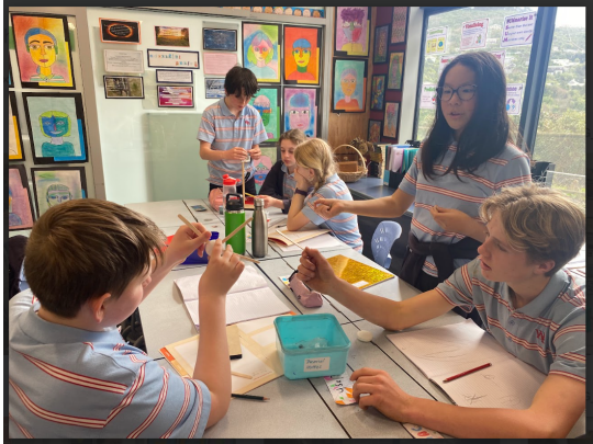
Artwork displayed at our Wadestown School Art Exhibition