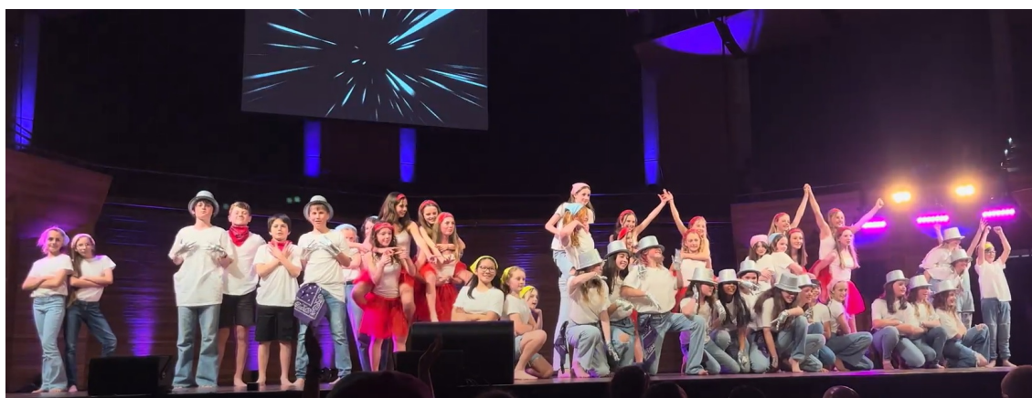
Memories from our Dance Splash performance at Michael Fowler Centre