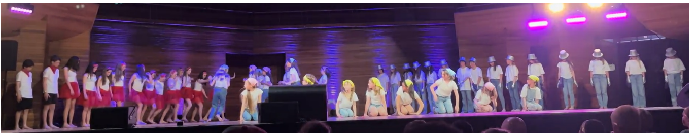
Kaitiaki Day - Keep New Zealand Beautiful