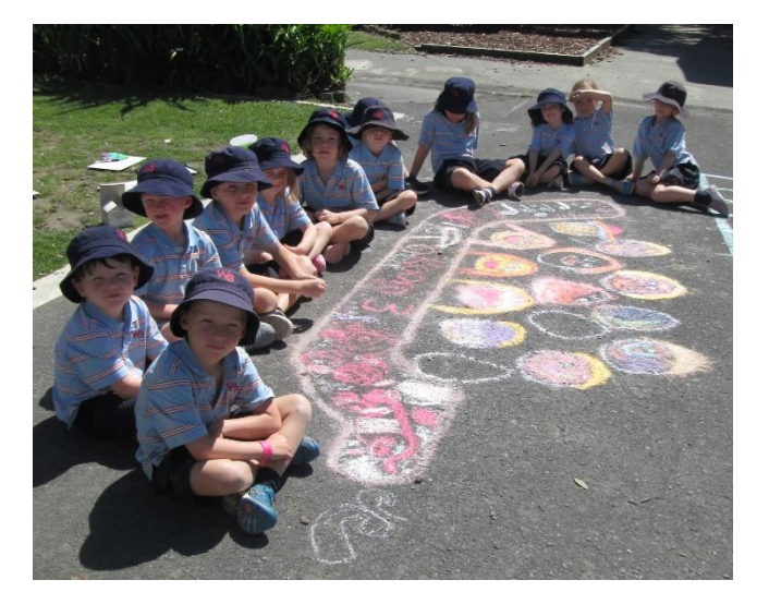
GRO W-WONDER ......is alive and well at Weld Street, our tamariki wonder how a caterpillar can change into a butterfly!!