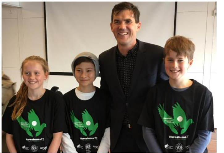
Tumanako Peace Day