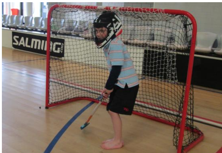
Sports at the ASB Sports Centre