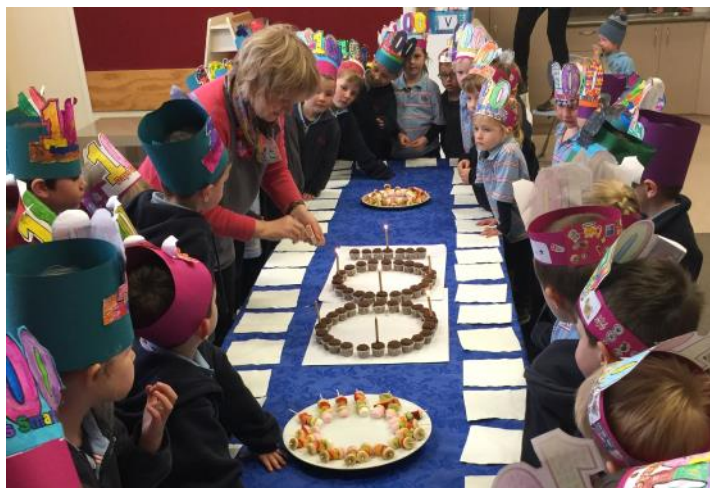
100 days of school celebration