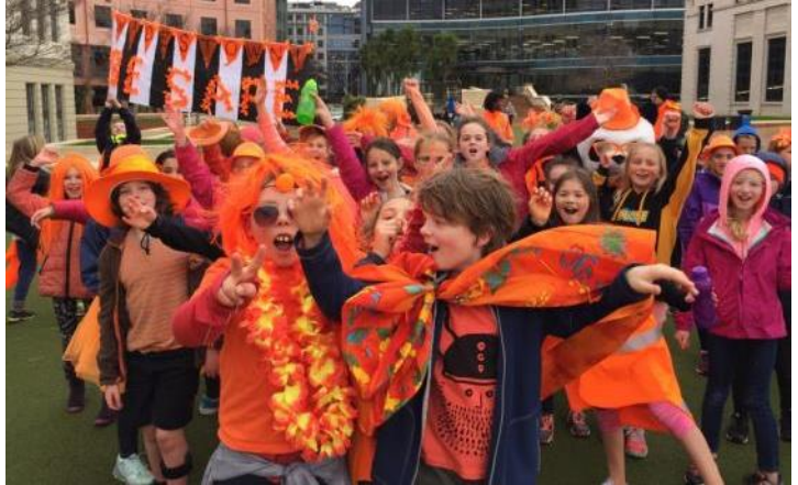
Orange Day Parade for Road Patrolters