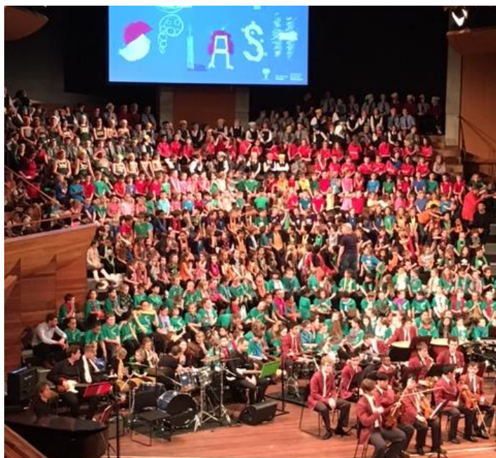
Artsplash and Dancesplash