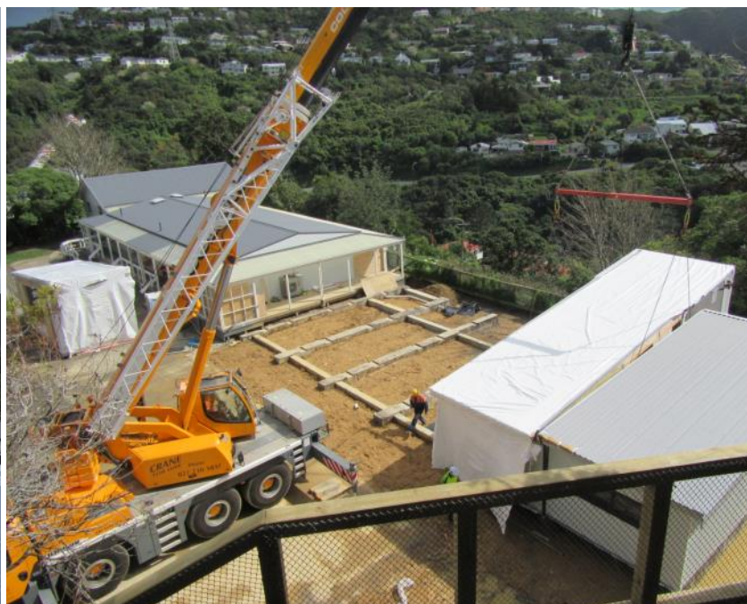
Great excitement with huge cranes moving the new classroom puzzle pieces into place this week