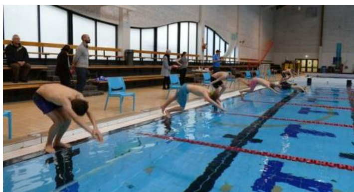
School Swimming Sports