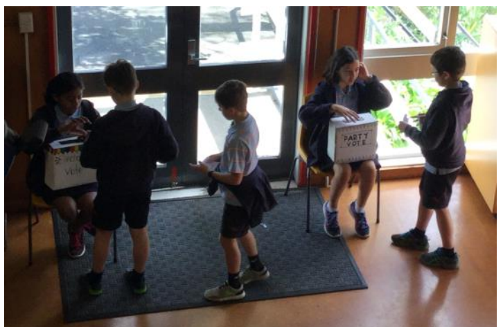
Year 5-8 students held their own general election