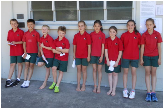
The winning Year 6 Girls and Boys relay teams